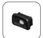
Magnifying Eye cup