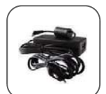
AC adapter kit