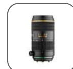
DA* 60-250mm lens