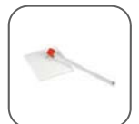
Sensor cleaning kit