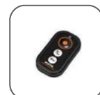
WP remote control